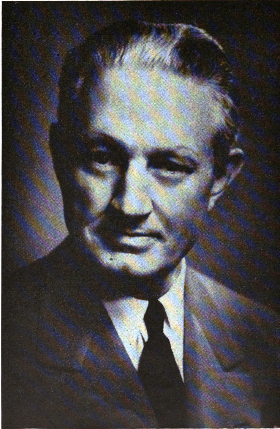
HON. KIM SIGLER Governor